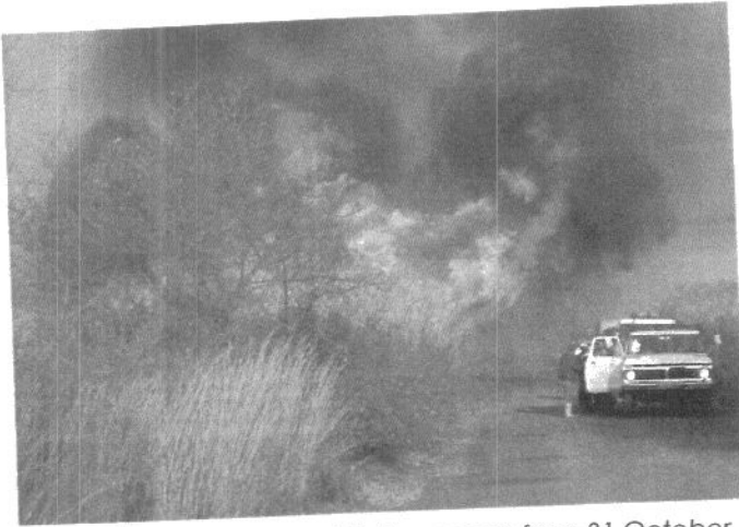
The North-West extended its fire season from 31 October to 30 November in 2013